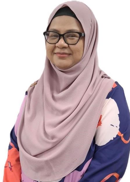
Mdm Azi FTGP, Art & PAL