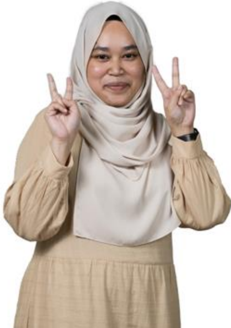
Ms Fitri ML & CCE 5.1