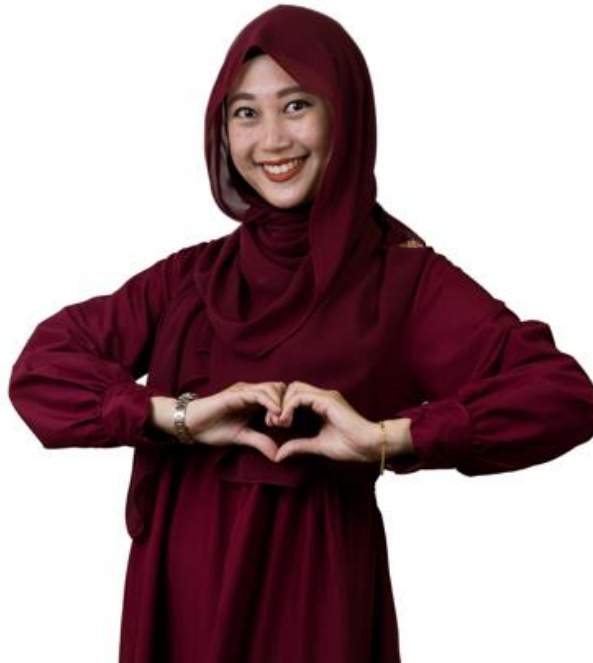
Mdm Amirah ML & CCE 5.2 HML