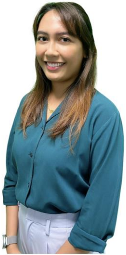
Miss Nursyafoqah MTL (Malay Language)