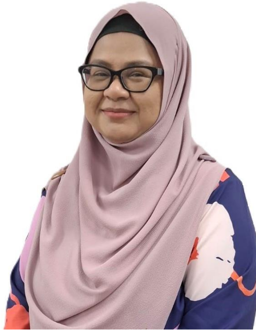
Mdm Azimah Art