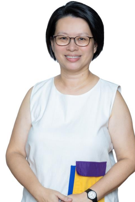
Mrs Foo Ai Sien Foundation Science