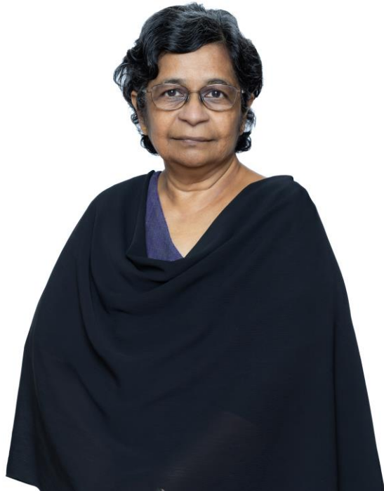
Mrs Anand Foundation English Language