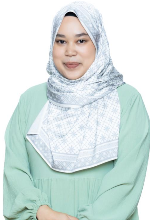
Ms Fitri ML & CCE 4.2