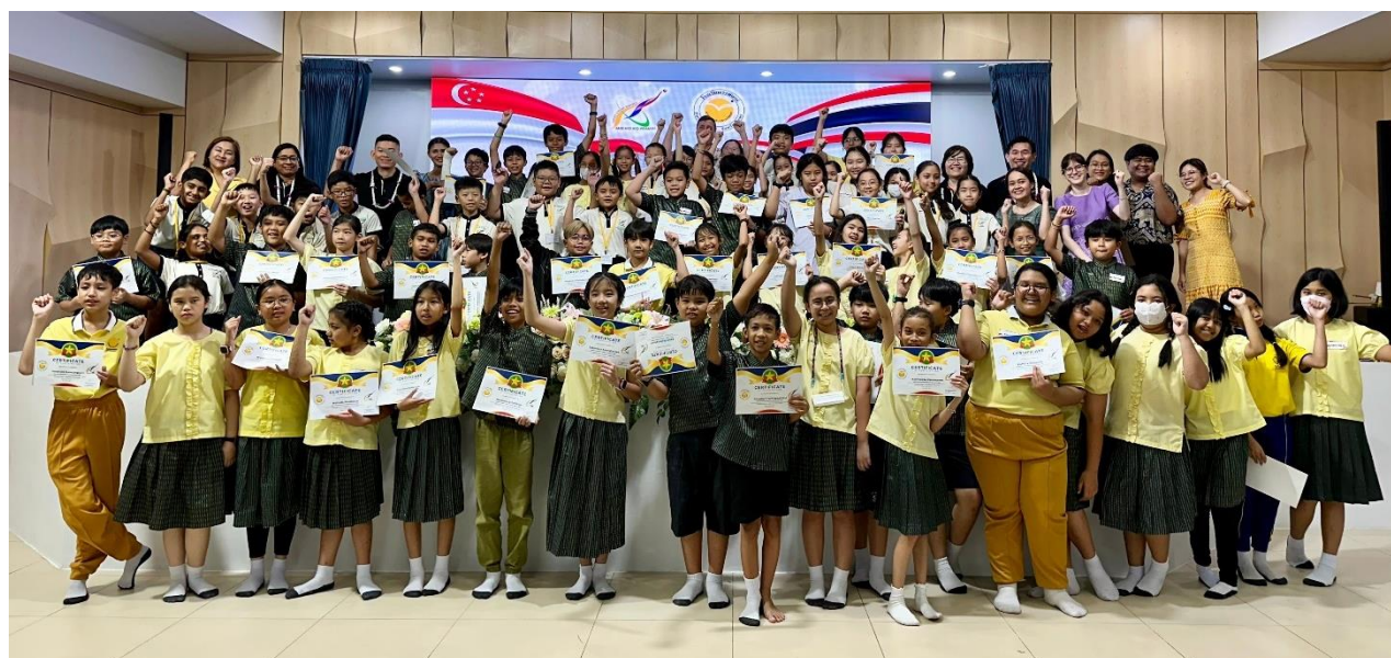
Photograph of our Primary 5 pupils and staff with the visitors from Warraphat School

It was an enriching learning experience for our Primary 5 pupils who formed new friendships with the pupils from Warraphat School and developed multi-cultural skills.