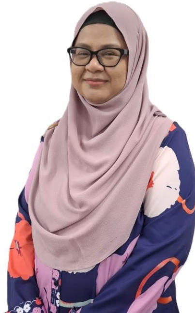
Mdm Azimah Art