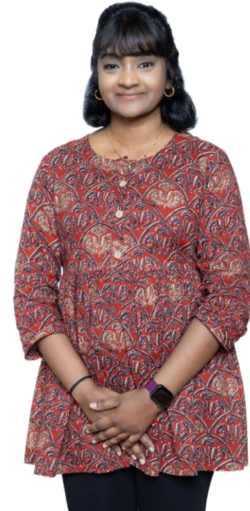
Ms Shamine Tamil Language & CCE (TL)